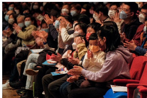
Swire Community Concert