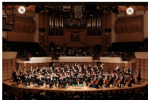
Music Director Jaap van Zweden and the HK Phil