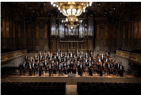
Music Director Jaap van Zweden and the HK Phil at the Tonhalle Zurich